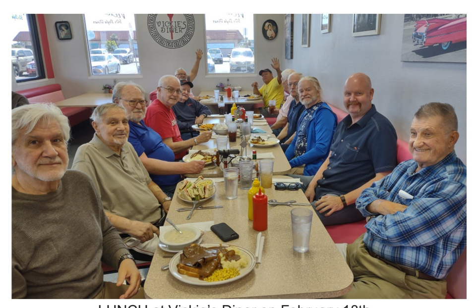
LUNCH at Vickie's Diner on February 18th