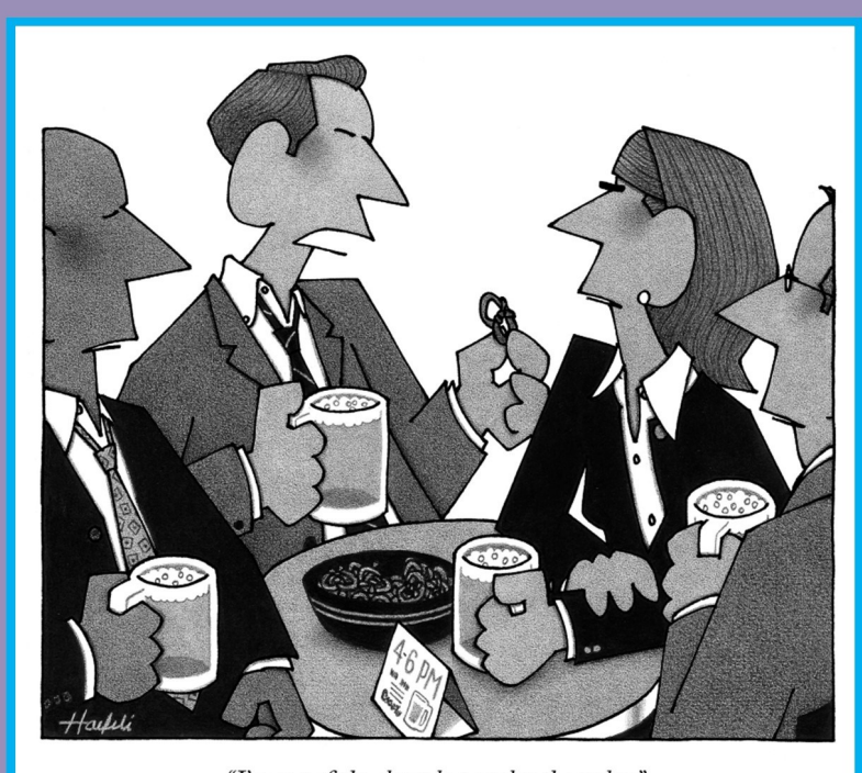
"I'm out of the closet but under the radar."