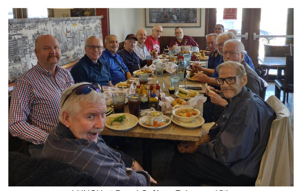
LUNCH at Bagel Café on February 15th