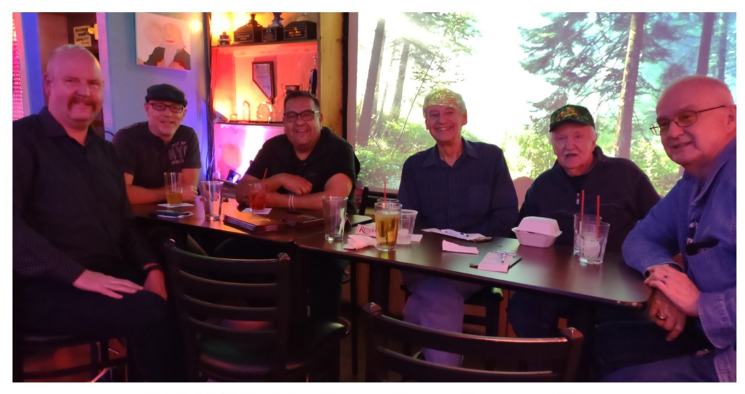
BAR NIGHT at the Phoenix Bar on February 10th