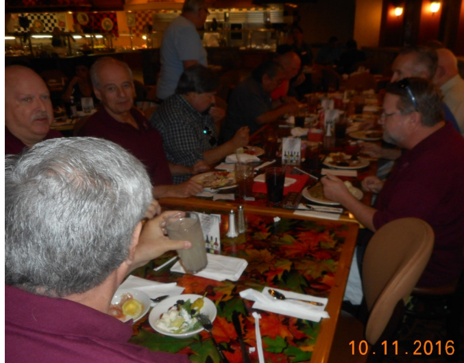
General Monthly Meeting and Potluck Luncheon - LGBT Center - October 15, 2016