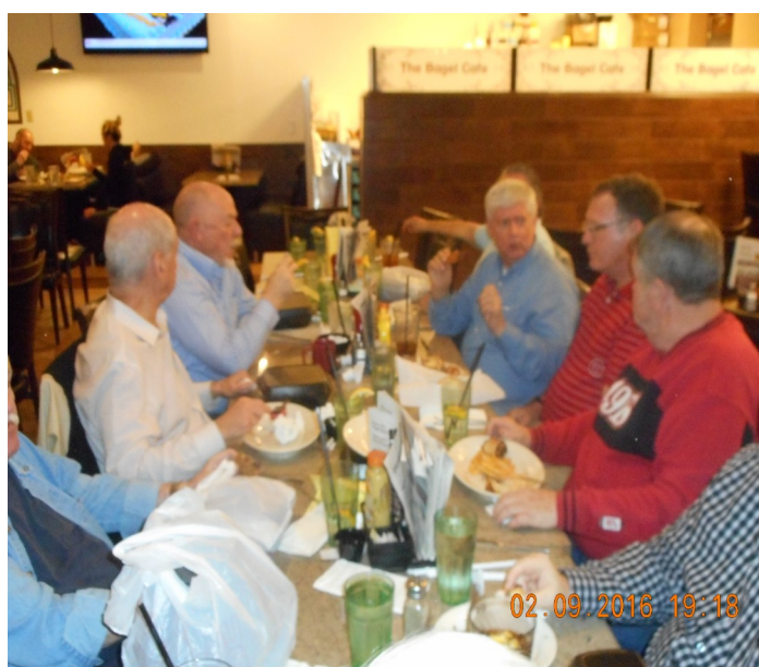
Dine-Out - February 9, 2016 - The Bagel Café