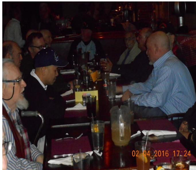
Early Dinner at Gilligan's Hideaway before Committee and Board Meetings