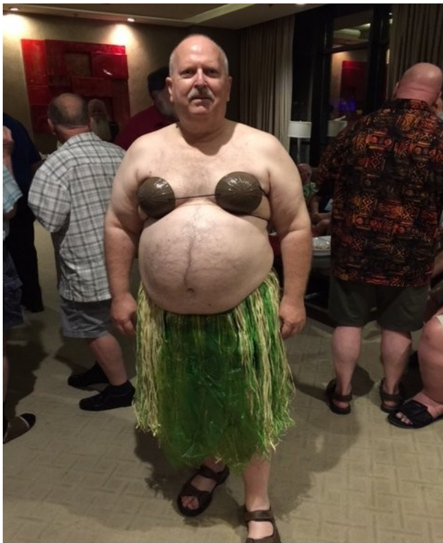
One of our swinging Bartenders