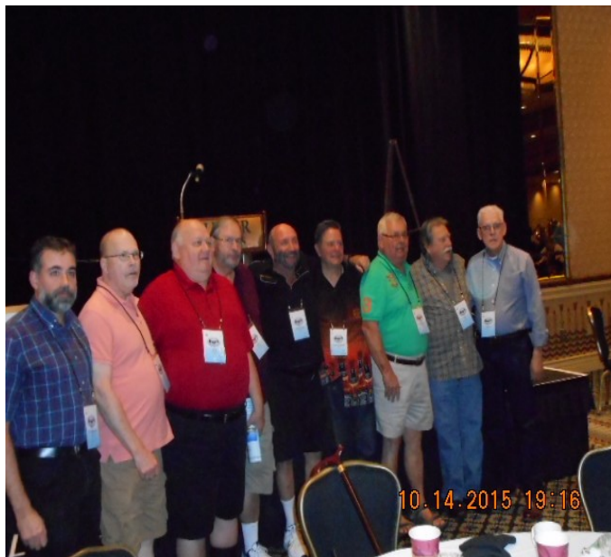
New Prime Timers World Wide Board until 2017