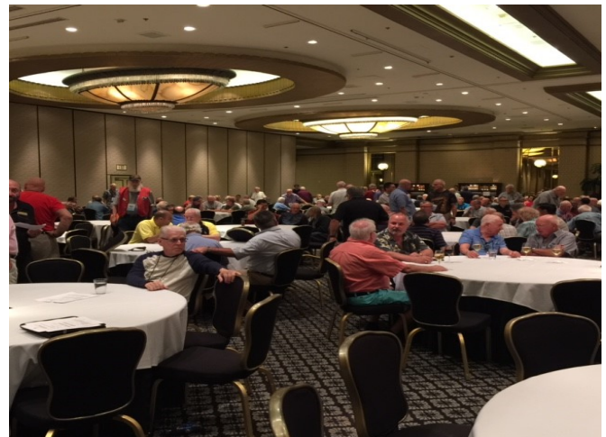
Some of the guests just hanging out waiting for something special to take place...