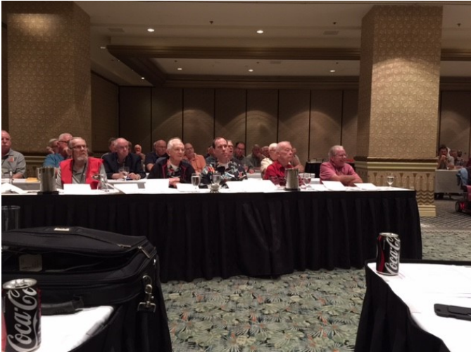
One of the several Seminars that were held