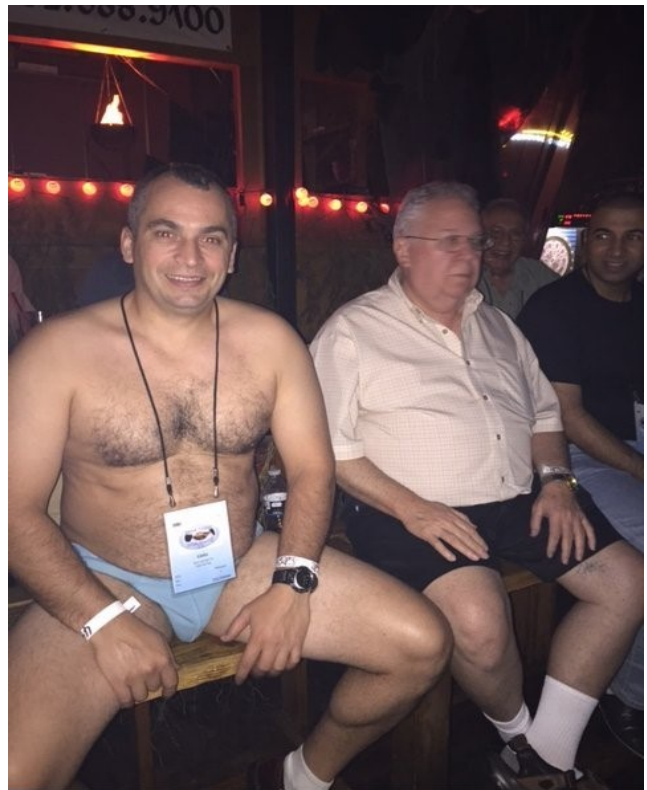
A couple of Guests..... Something for everyone