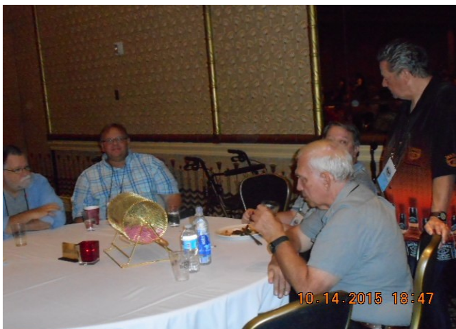
Just waiting for the dinner bell to ring..... "Where's the Beef"???