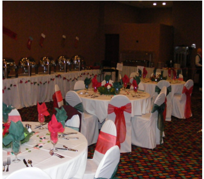
Banquet Hall and Buffet Line at Joker's Wild Casino