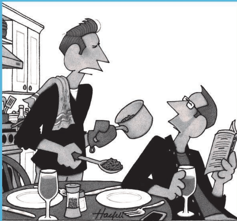
"It would be nice if we had marriage equality within our marriage."