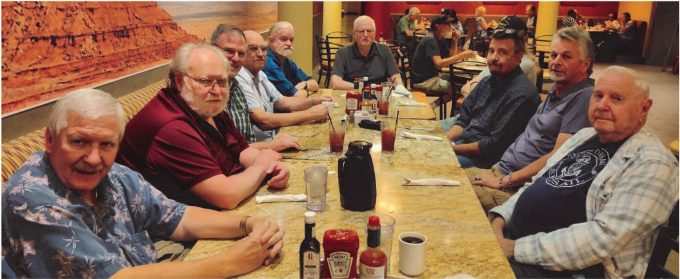
BRUNCH at Sourdough Café on October 2nd