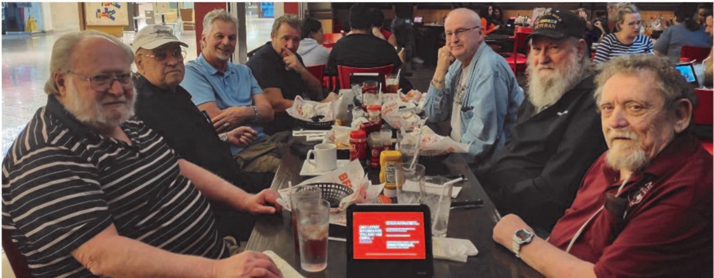
DINNER at Red Robin on October 20th