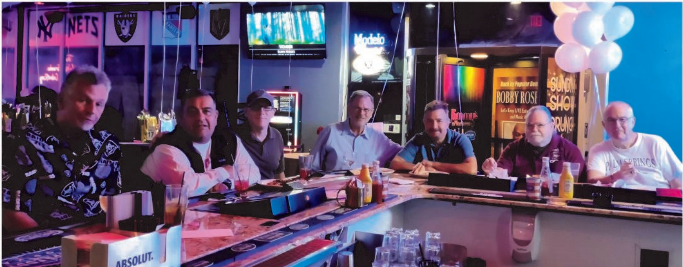
BAR NIGHT at Jimmy's @ Madisons on October 7th