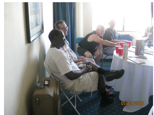
^ More Laughlin Trip photos ^