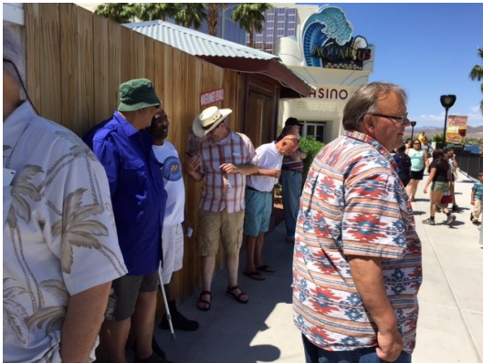
Waiting to board