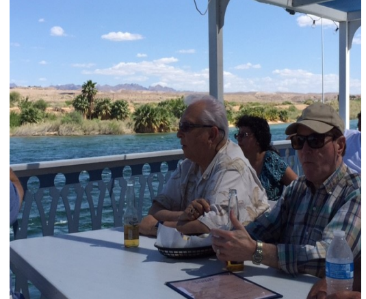
< Riverboat > Celebration