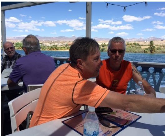
On Board the