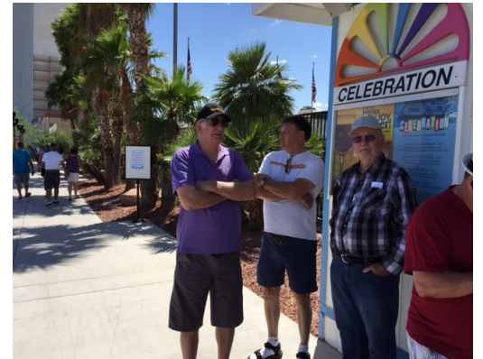
< Riverboat > Celebration