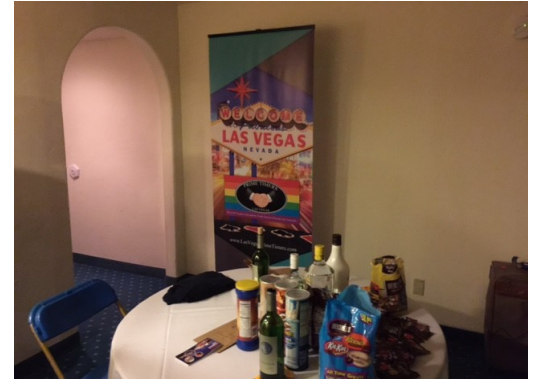
————— Hospitality Room at Harrah's Hotel >