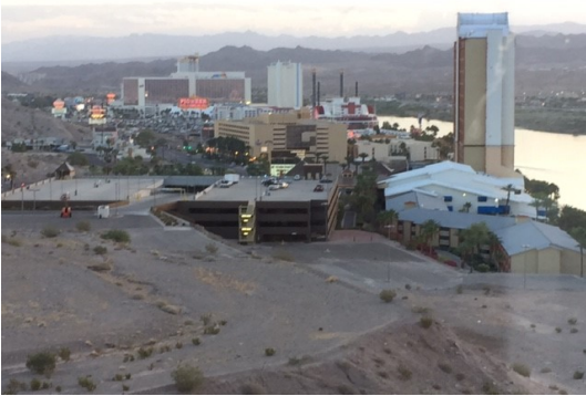
< Laughlin, NV