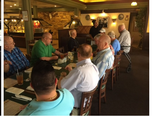
^ First time lunch at Dessy B's Restaurant on Saturday May 2nd. ^