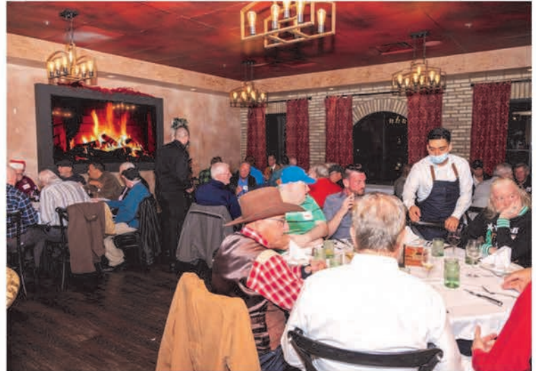
CHRISTMAS PARTY Nora's Cuisine Italian Restaurant on December 14th