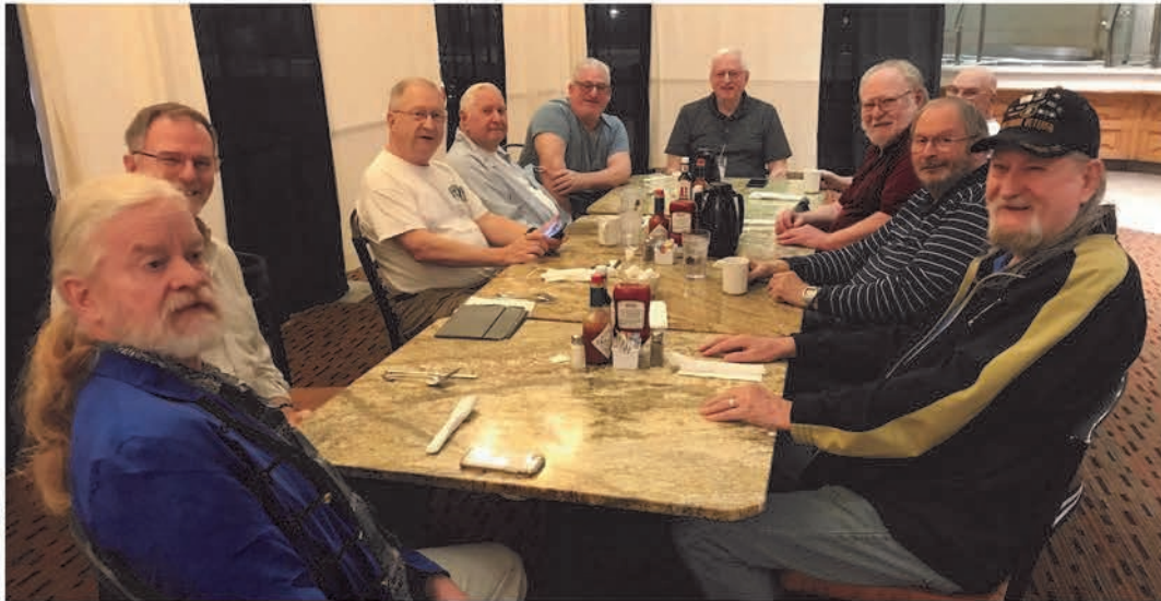
BRUNCH at Sourdough Café on December 4th