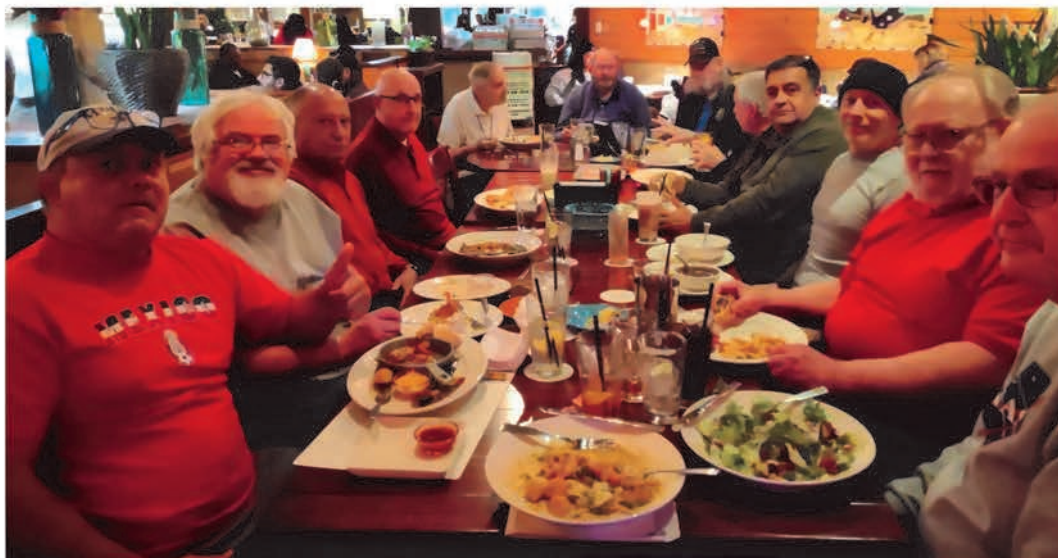
DINNER at Bahama Breeze on December 29th